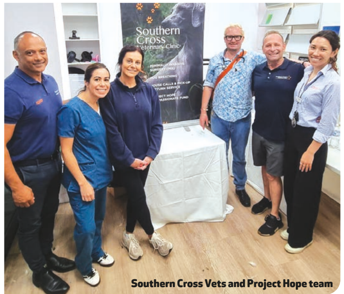
Southern Cross Vets and Project Hope team

We are so grateful for this partnership and the genuine care shown to our community. Access to veterinary support like this makes a real difference to the lives of our pets and to us!