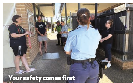
Your safety comes first

The Connect and Protect Program reflects our commitment to listening to tenants and working with community partners to create safe and connected places to live.