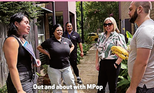
Out and about with MPop

We acknowledge and pay our respects to the First Nations people and communities of this land.