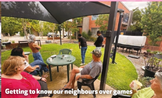
Getting to know our neighbours over games