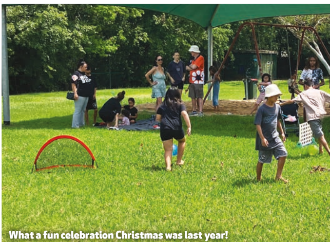
What a fun celebration Christmas was last year!