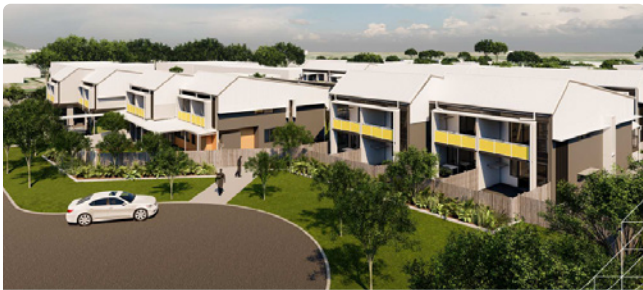
Architect's image of the new Youth Foyer in Townsville.

Youth Foyers have been extremely successful at breaking cycles of homelessness and