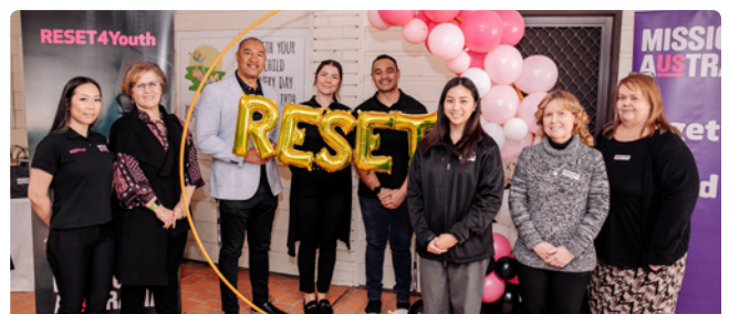
The RESET4Youth team celebrate opening their doors to young people in need.

“Homelessness can often be incredibly isolating, destabilising, and traumatic for young people.